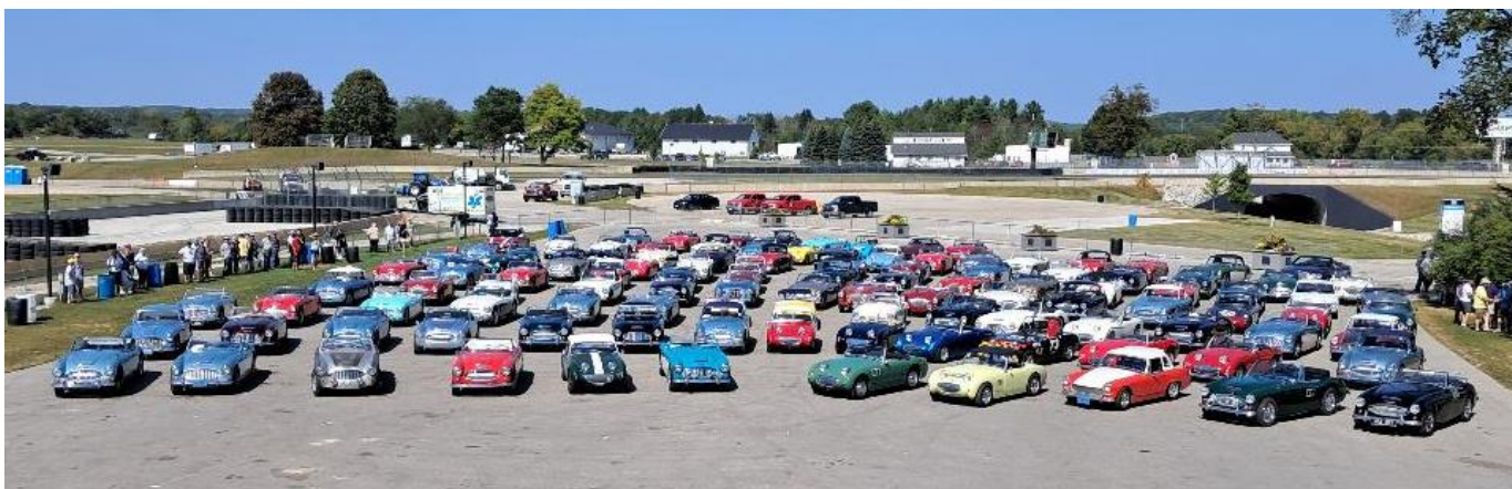
This wasn't all the Conclave Healeys, but it's a good Where's Waldo shot of a good number of them.

Following the Funkhana/Gymkhana events and around 100 Healeys lapping the track, the cars gathered for a group picture.