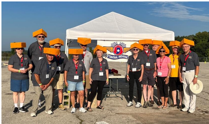
Our crew at Funkhana

We had less participants than expected at the Funkhana due to the Gymkhana going on at the same time. That gave us time to play on the course. After closing the course, we took the equipment back to the hotel. The cornhole boards and the cheese hats were sold at the auction events to recoup some of the expenses for the Wisconsin club. We had planned on taking any remaining bags of Cheez-Its to the hospitality area, but the host hotel wouldn't allow it.