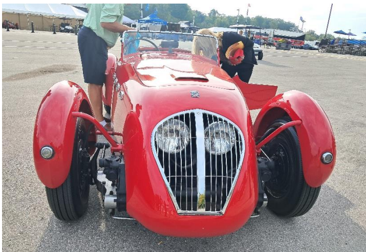
One of the Silverstone Healeys at Road America

During the racing lunch break, the Healeys from the Coral went out to tour the track, doing 5 laps around the 4+ mile circuit. Later that afternoon, there was a tour of most of the original Road America racecourse on the streets around Elkhart Lake with a police escort. It's fascinating to think of the cars racing on the narrow streets and through downtown Elkhart Lake.