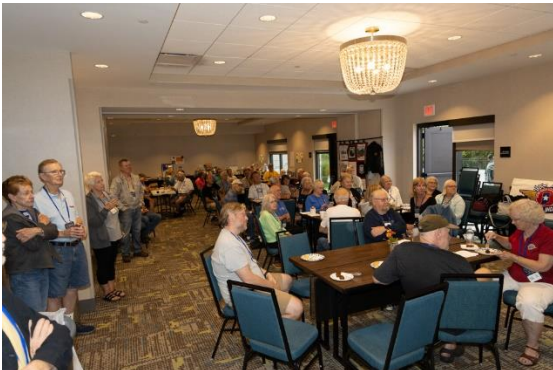
Rapt attention to the awards.