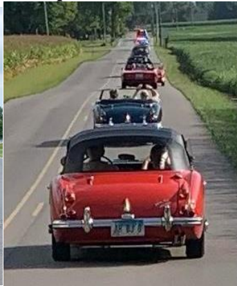
Police escort.