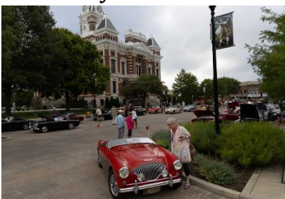
Courthouse setting for the car show.