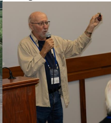
Lost keys will be auctioned. (BH)