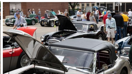
The locals check out the Healeys. (BH)