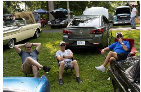
Sitting around telling lies.