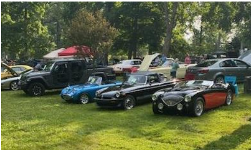
Great morning shade.