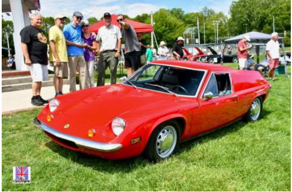
Tiny American Austin, Bond Bug, and Best in Show Europa