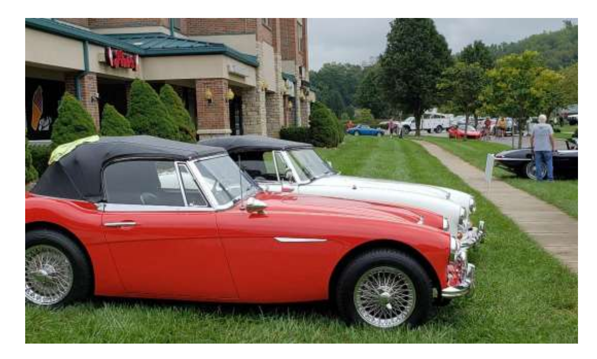
If you look closely, you can see the Sprite at the end of the space that was supposed to be full of Healeys.

In the raffle at the event, I won our second car wash kit in 24 hours. Fortunately, some friends were there to carry it home for us, as the Sprite was completely loaded.