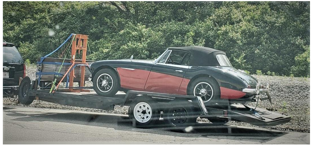
Sorry for the poor quality photo, I shot it through my windshield.