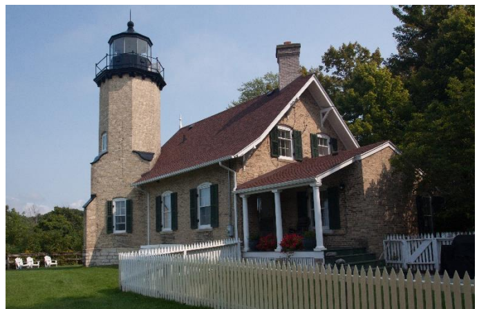
White River Light Station.