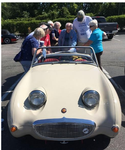
The beginning of the end