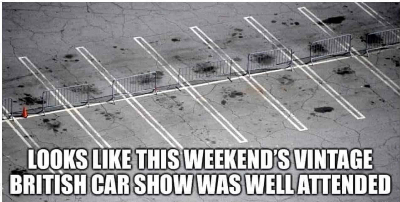
(If the oil ain't leaking out the bottom, it doesn't have any oil in the top.)