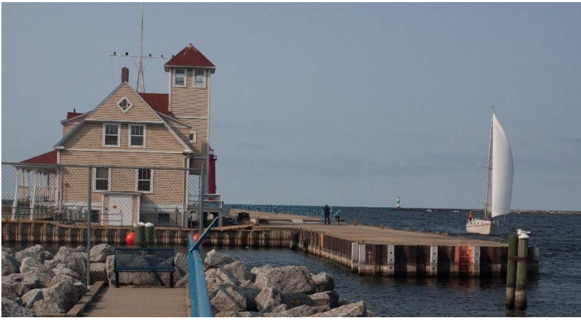
Coast Guard Station at Muskegon South Pierhead.