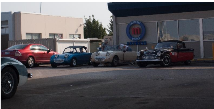
Filling up for Saturday's drive.