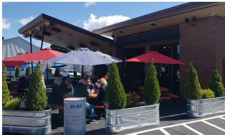
The group enjoys lunch at Denver's Garage.

Jim and Bev picked out good destinations for our September meeting and drive. The morning began at Ft Ben where we had coffee and donuts for our outdoor meeting. After the meeting, we hopped in the cars for a leisurely drive around Geist Reservoir and over to Fortville for lunch at Denver's Garage Pizza and Brews. After some good pizza, we took off to New Palestine for ice cream. See a pattern? I could start having more difficulties squeezing into the Sprite!