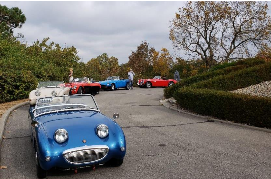
The Healeys circle the 'Crown' at James Witcomb Riley's grave.