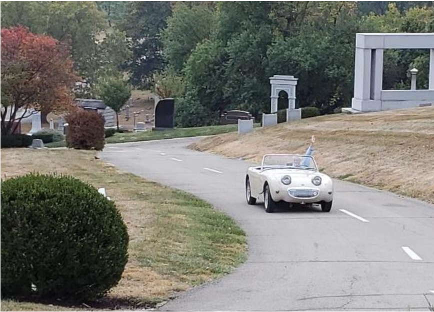
Jim climbs to the 'Crown'.