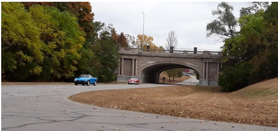
The Switzers and Dave Verrill entering the South portion of the cemetery.