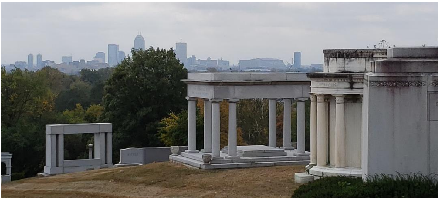
The view from James Witcomb Riley's grave.

JAMES WHITCOMB RILEY, THE "HOOSIER POET," WAS BURIED HERE IN 1917. KNOWN AND ACCLAIMED INTERNATIONALLY FOR HIS POETRY ABOUT LIFE IN THE HEARTLAND, HE IS BEST REMEMBERED TODAY FOR HIS POEMS THAT APPEAL TO CHILDREN AND TO THE CHILD IN ALL OF US, SUCH AS "LITTLE ORPHANT ANNIE" AND "THE RAGGEDY MAN." HE WAS ESPECIALLY LOVED BY THE MANY LOCAL CHILDREN WHO WERE ABLE TO ENJOY NOT ONLY HIS POETRY, BUT ALSO HIS TIME AND LEMONADE ON THE FRONT PORCH OF HIS INDIANAPOLIS HOME ON LOCKERBIE STREET. AFTER HIS DEATH CHILDREN BEGAN DONATING COINS TO HELP PAY FOR HIS MEMORIAL. THE TRADITION OF LEAVING COINS ON HIS MONUMENT CONTINUES TODAY AND THE MONEY COLLECTED IS DONATED TO MR. RILEY'S LEGACY, THE RILEY HOSPITAL FOR CHILDREN.