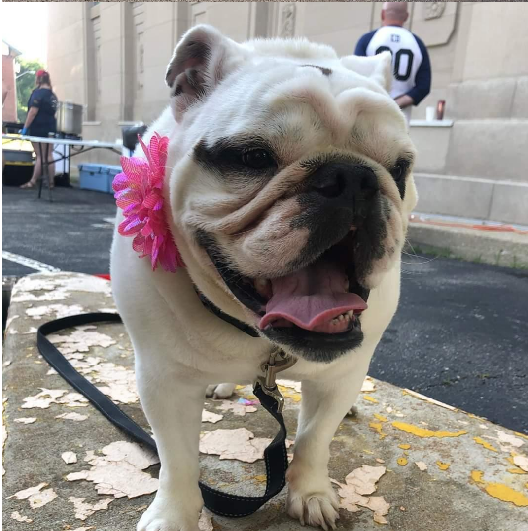
Just one of the gorgeous ladies at C&G