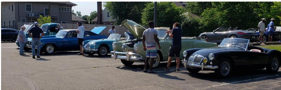
2 very nice MGAs