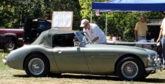
Dayton Class winner 100s