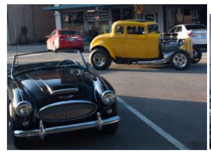
One of the recurring events is the Noblesville Cruise-in. A good time on Saturday evening.