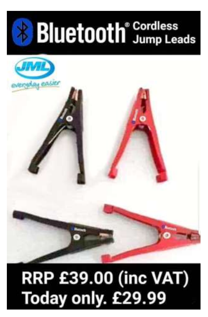
The British are coming out with some new products!