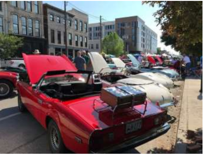
Car Show in NULU