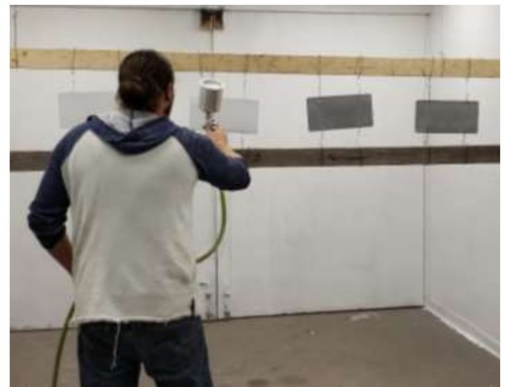
Shooting the sealer